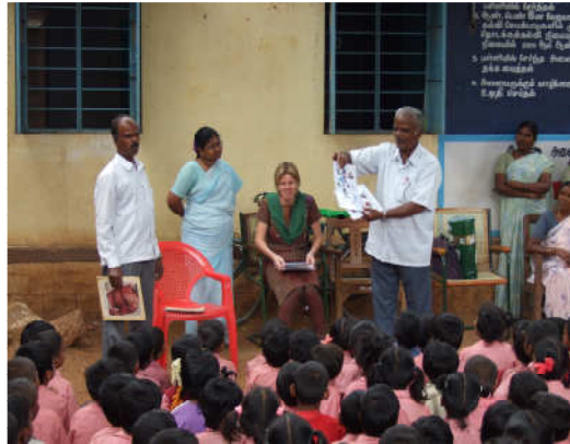
Health & Leprosy Awareness Activities Participated VIP Mrs Agnes Volunteer from Netherlands