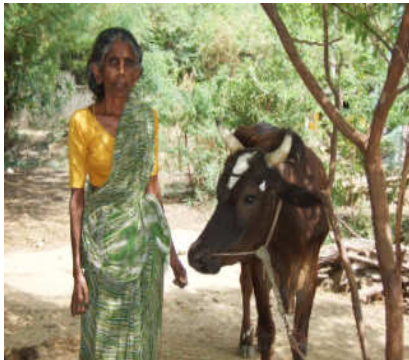
The woman told proudly that the cow gave birth to a female calf a few weeks ago. So, that means that she will have in a few months a double income of milk. The cow was a loan out of the rehabilitation program, monthly she's paying back a small amount.