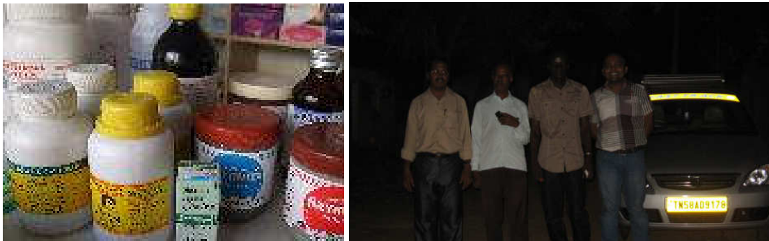
Mobile Medical team in Sambakkulam village, Madurai district, Tamil Nadu, India.