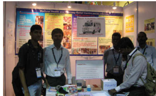
Bombay Leprosy Project Director Visited our Stall